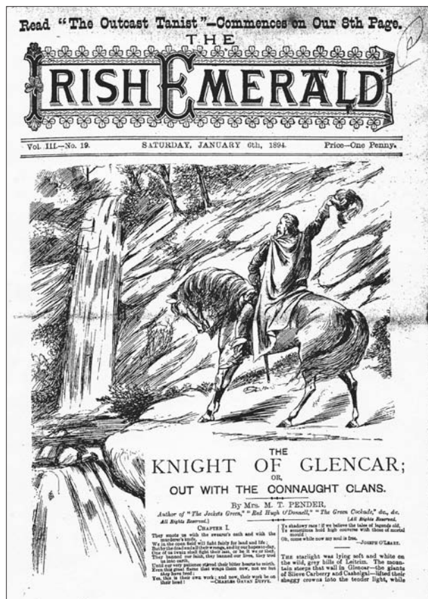
Illustration which accompanies the 1st chapter of The Knight of Glencar in the Irish Emerald 6th Jan 1894

This romantic tale is set almost entirely in North Leitrim during the