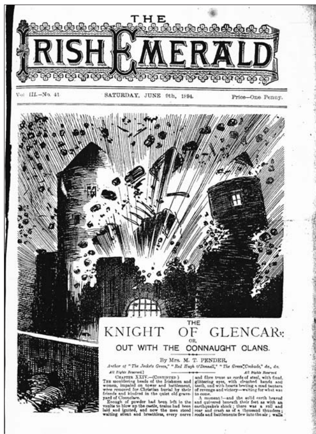
Illustration depicting the destruction of Castle Hamilton in The Knight of Glencar

In 1970, in an attempt to stimulate the tourism sector in North Leitrim, several organisations, drawing their inspiration from Smyth's novel, designated the whole northern half of the county as 'The Wild Rose Country'.