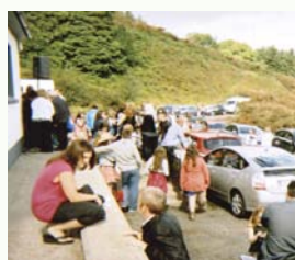
◀ Left of the Church Right of the Church ▶