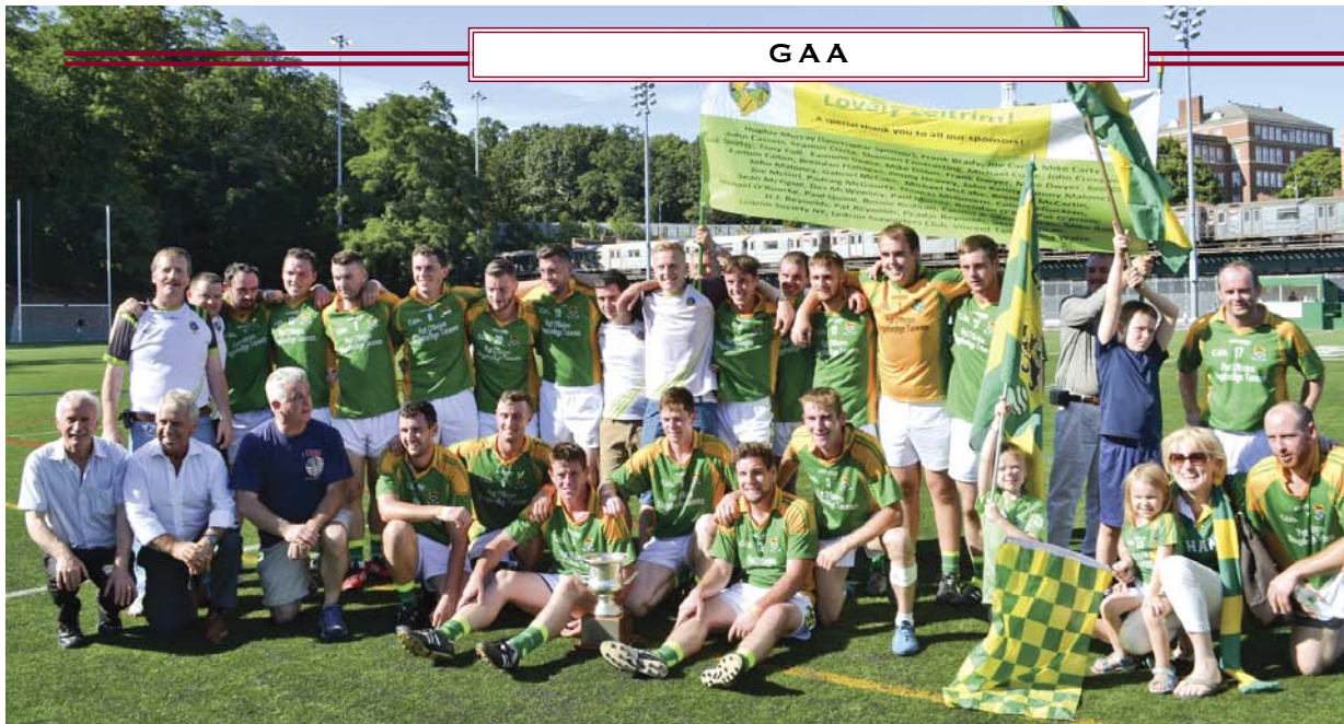
■ The Leitrim team, management, and supporters celebrate their victory.