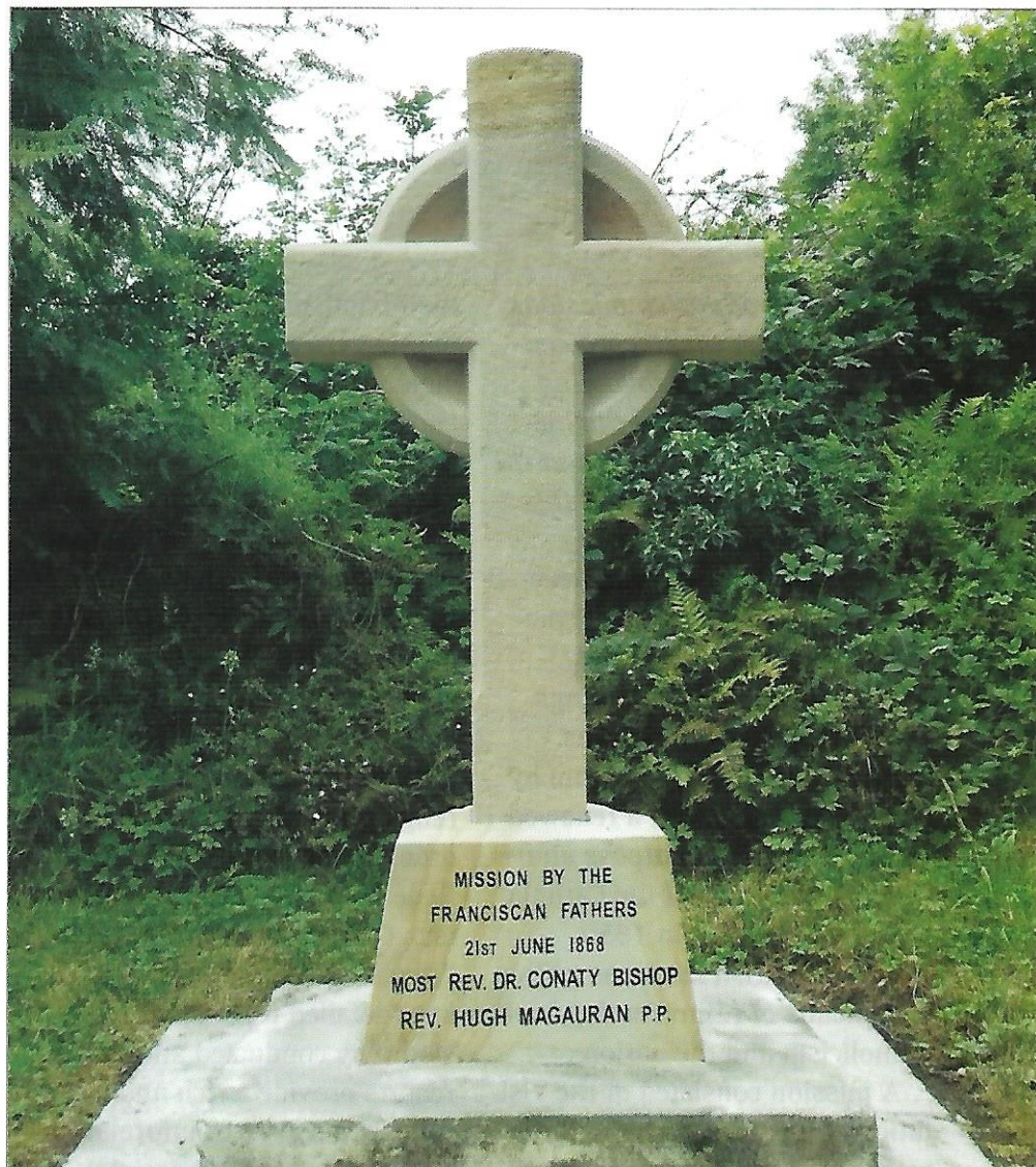
■ Mission Cross, Glencar