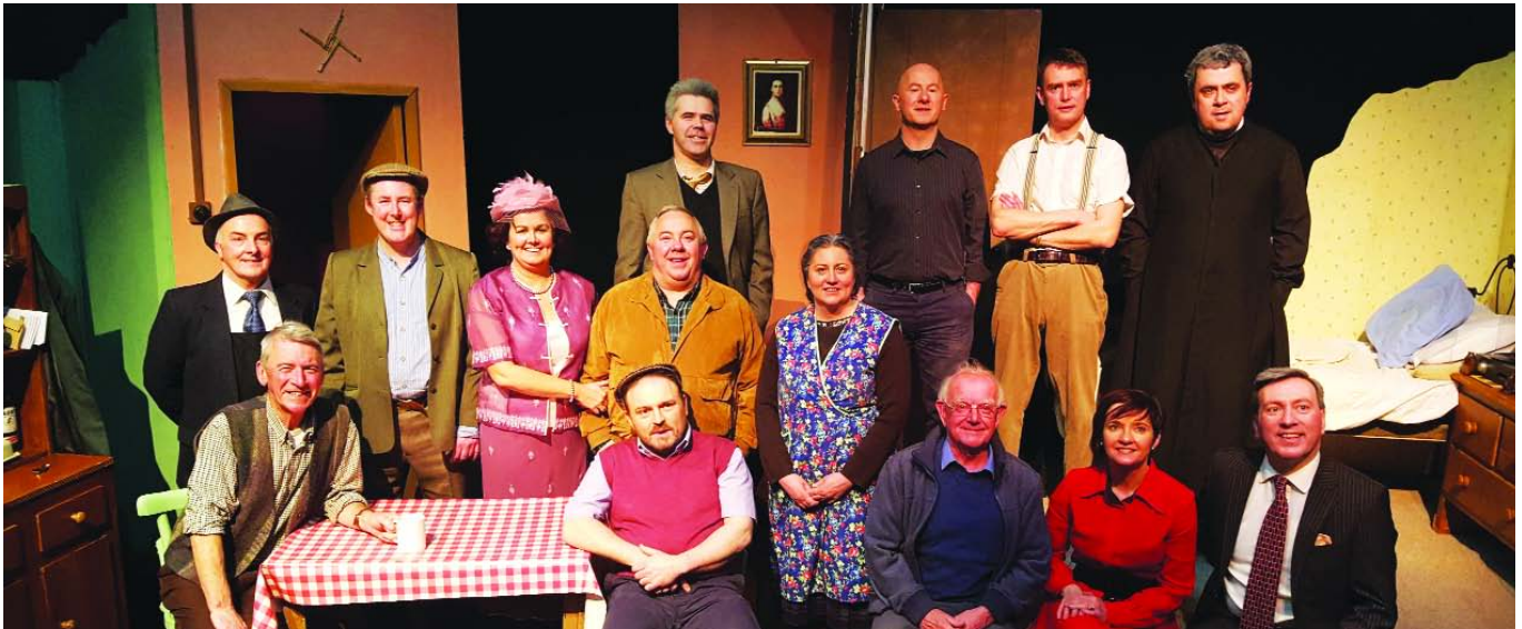
Above: Cast of Philadelphia Here I Come