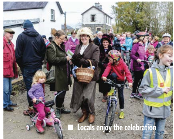
■ Locals enjoy the celebration