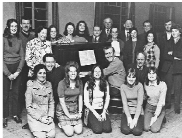
■ (Top): Mohill Music Society: Snow White and the Seven Buffs 1975