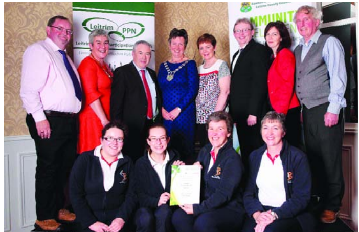
■ Manorhamilton Girls' Brigade with members of the PPN & Leitrim County Council

We were delighted to win the Social & Inclusion award and then later in the evening to be awarded the overall award for our Outstanding Contribution to our community. This is what the judges had to say: "The overall winner for the county literally "blew the judges away" with the group's passion and commitment to their projects and how the group operates on almost fresh air without even a physical base for their equipment. This group has tailored its activities to meet the needs of its users and ensures that every member is valued and can participate to the best of their abilities. Members make key decisions about the plans for the year to come".